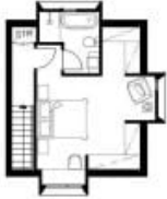
ATTIC LEVEL PLAN