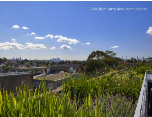
View from same level common area