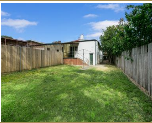
146 Alt Street Haberfield, NSW