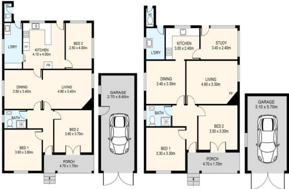
10 Harris St FIVE DOCK