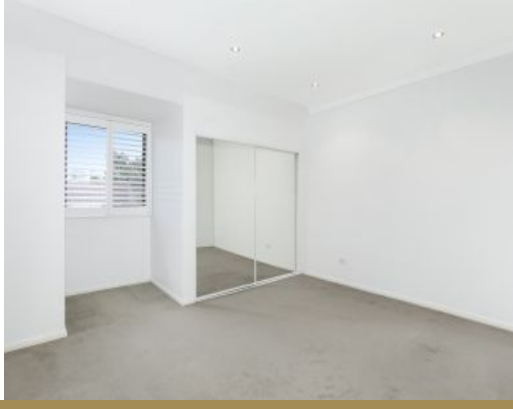
4/22-24 Regatta Road Canada Bay, NSW